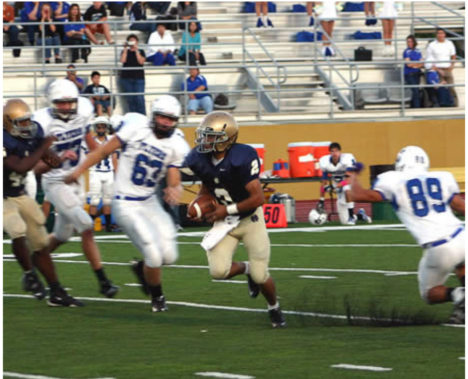
A Holy Cross ball carrier breaks through the opponent's line.